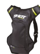
HYDRA BAG RANDO CLIMATIC BLACK A08-41E1-A01