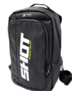
HYDRA BAG TRAIL CLIMATIC BLACK A06-41F1-A01