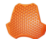
CHEST D30® PROTECTION CP1 L1 CHEST CERTIFIED EN1621-3 LEVEL 1

SHOT AIR GUARD SRG-1 BLACK SIZES XS to 2XL 506-SRG1