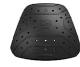
CHEST PROTECTION CERTIFIED EN1621-3 LEVEL 2

SHOT AIR GUARD SRG-1 L2 BLACK SIZES XS to 2XL 506-SRG1L2