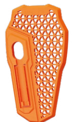
BACK D30® PROTECTION SPECIAL IN&MOTION BP L2 CERTIFIED EN1621-2 LEVEL 2